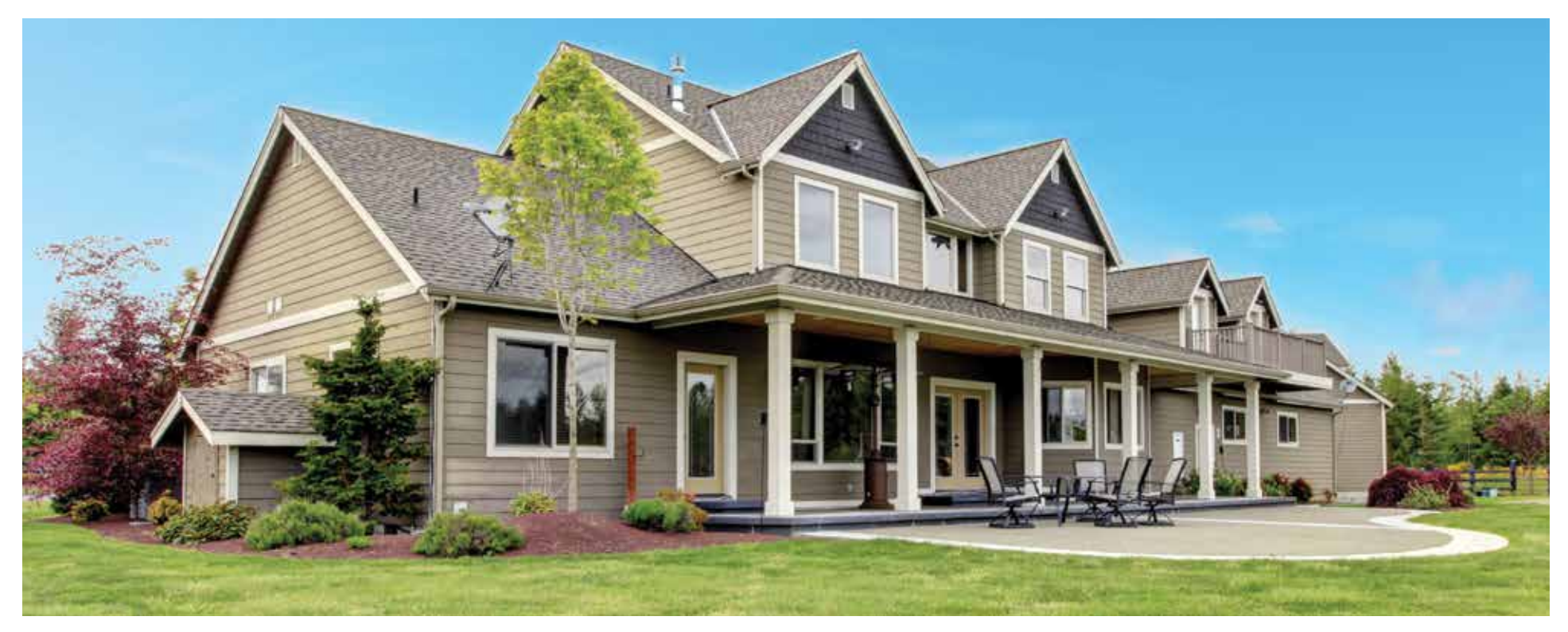
The traditional elegance of our Double 4", Double 5" and 8" Clapboard is accentuated with an inviting roughsawn texture. (8" Clapboard shown.)

With an artful balance of form and function, SteelTek Supreme presents four distinctive profiles: Double 4" Clapboard, Double 5" Clapboard, 8" Clapboard and 12" Vertical Board & Batten. The high-style warmth of each panel is further enhanced with natural-looking wood textures and colors that mimic nature. Matching and complementing trim and accessories complete the design, inspiring a perfectly pulled-together finished look that truly stands apart.